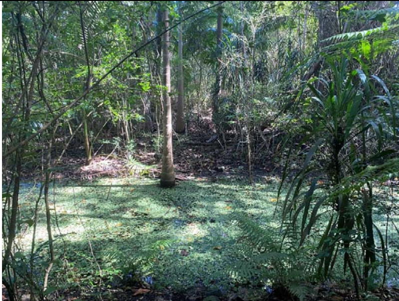
Site 005 – Dam Drain (Downstream) (18/04/2023)