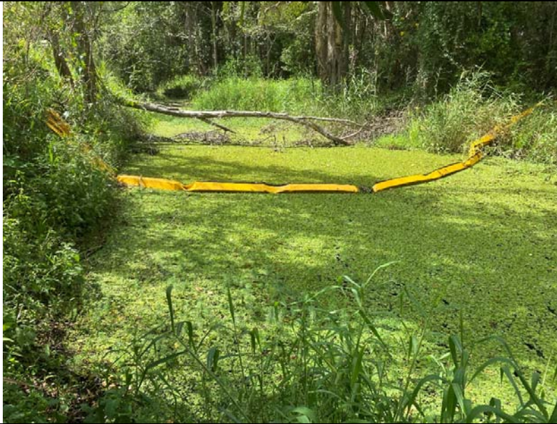
Site 003 – East Creek (Upstream) (18/04/2023)