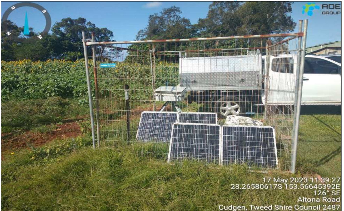
Photograph 2: Representative photograph of monitoring location 006 – Mate and Matts, as observed 17/05/2023