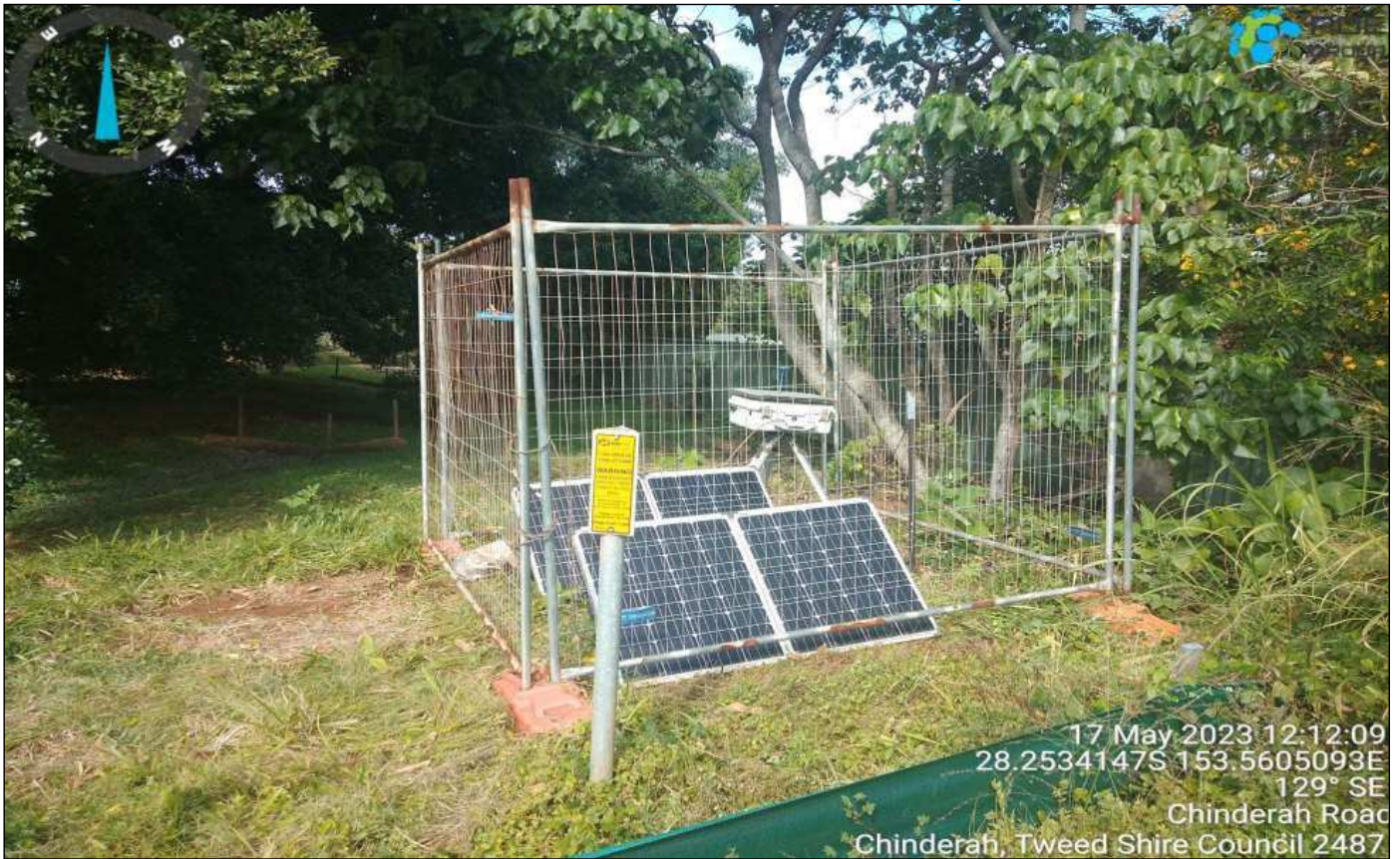
Photograph 1: Representative photograph of monitoring location 005 – Solar Industry, as observed 17/05/2023