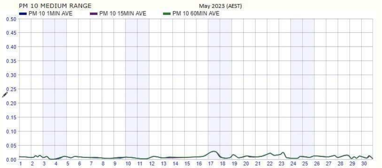
Figure 3. Summary of PM10 from the real time monitoring at location 007 – Residential for the month of May 2023.