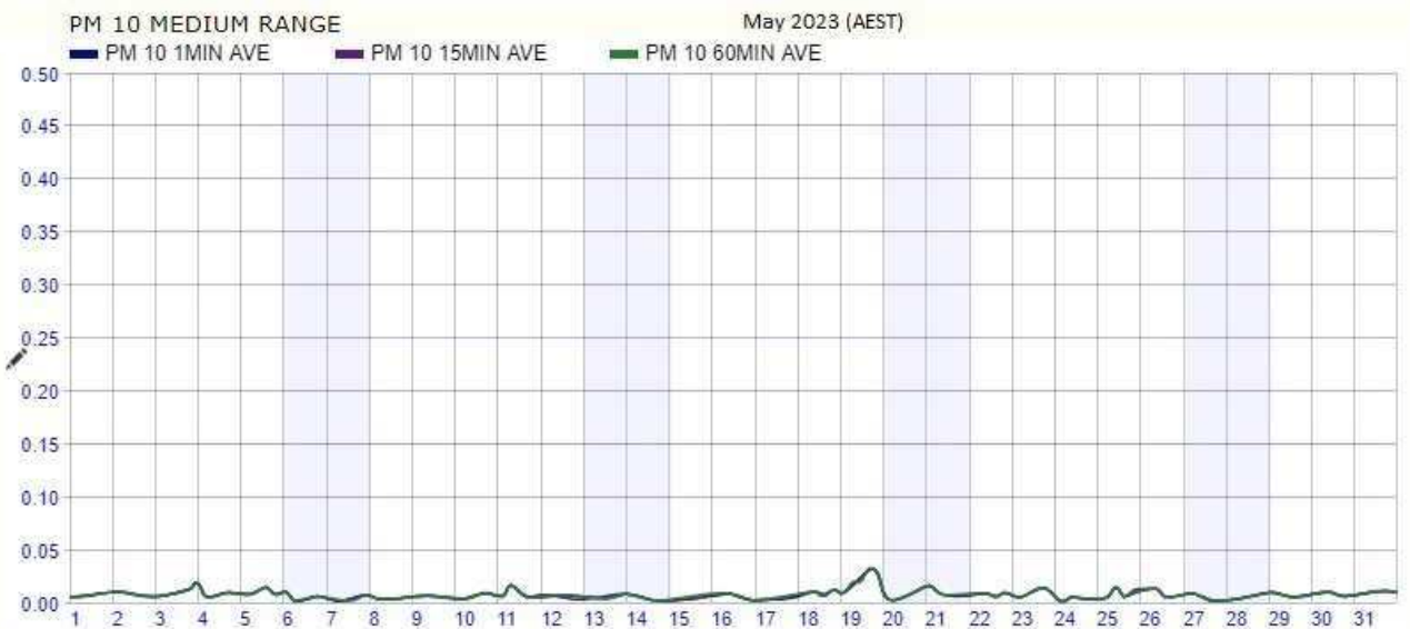
Figure 2. Summary of PM10 from the real time monitoring at location 006 – Mate and Matts for the month of May 2023.