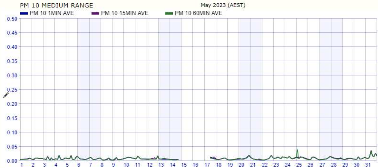
Figure 1. Summary of PM10 from the real time monitoring at location 005 – Solar Industry for the month of May 2023.

Figures below show monthly dust results for each of the three (3) monitoring locations. All graphs below express dust levels as an hourly average and values <0.001 mg/m 3 will be recorded as 0 mg/m 3 and will not be graphed.