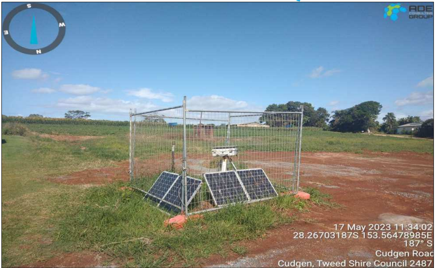
Photograph 3: Representative photograph of monitoring location 007 – Residential, as observed 17/05/2023