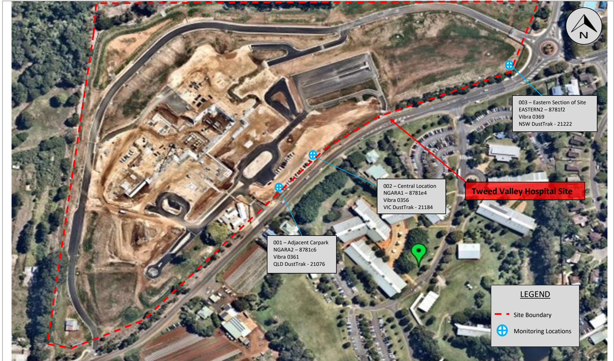
Aerial photograph of the Tweed Valley Hospital Project at Kingscliff, NSW (as of 30 November 2020).