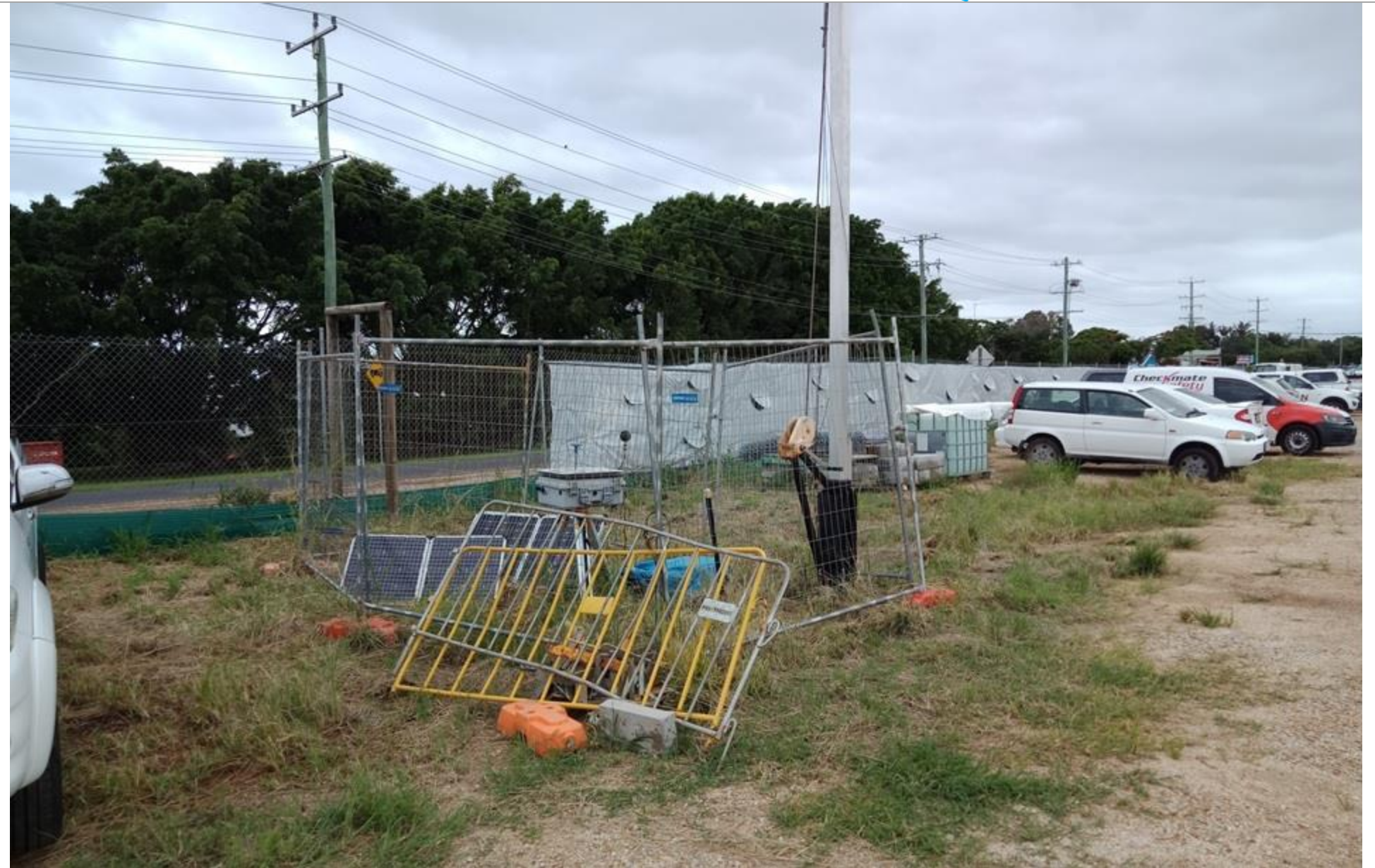
Photograph 2. Representative photograph of monitoring location 002 – Central location, as observed 21 January 2021.