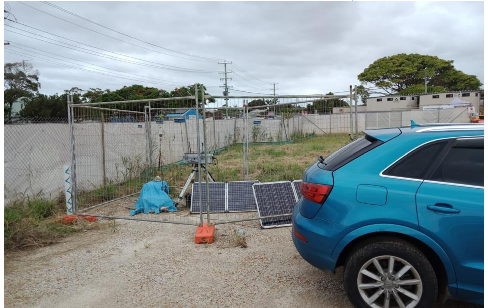
Photograph 1. Representative photograph of monitoring location 001 – Adjacent Carpark location, as observed 21 January 2021.