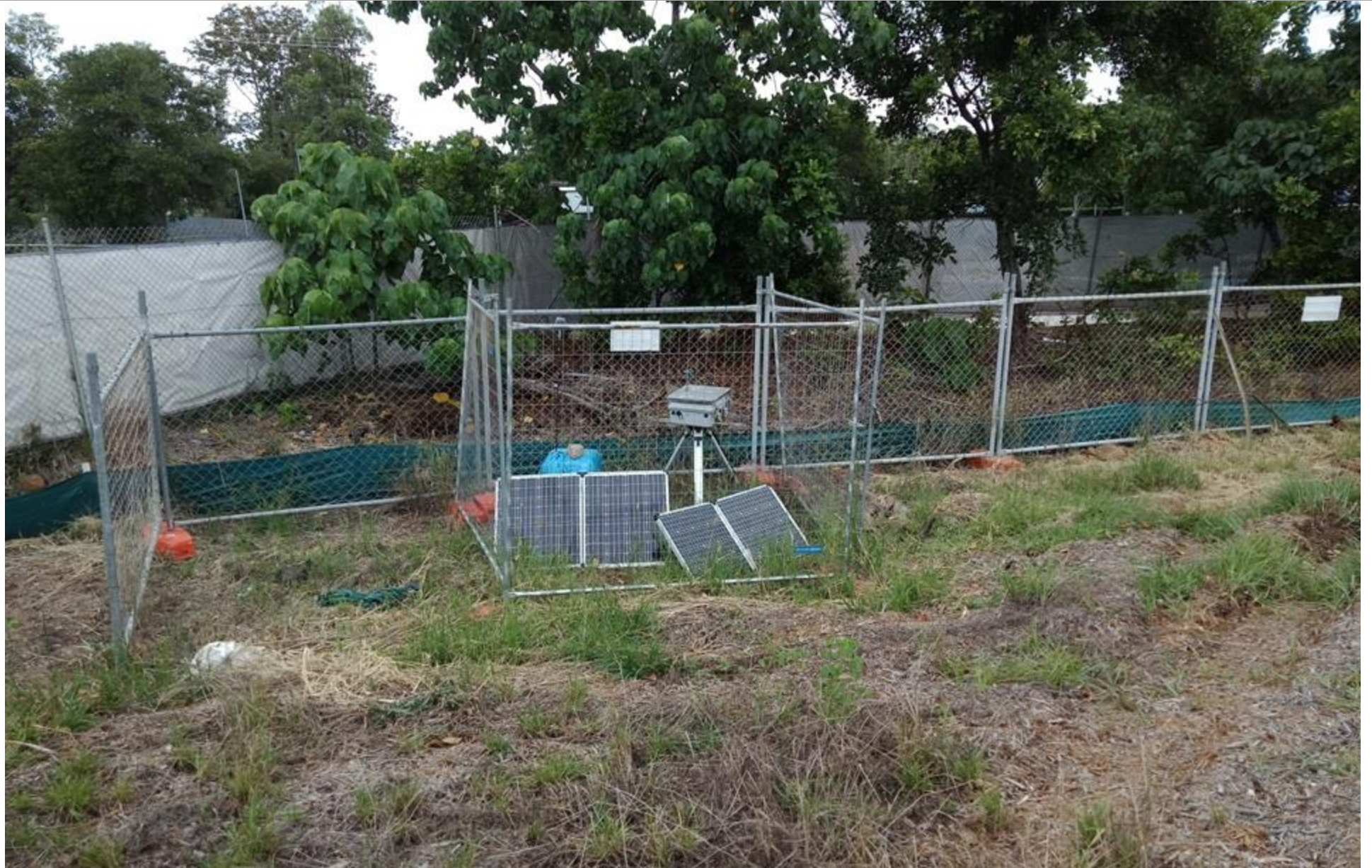
Photograph 3. Representative photograph of monitoring location 003 – Eastern Section of Site, as observed 21 January 2021.