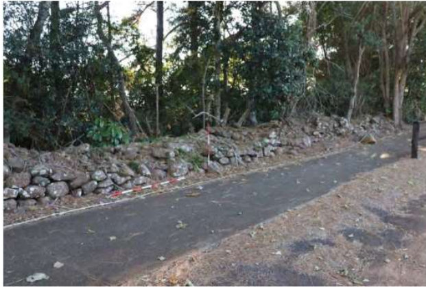
Plate 2. Wall 1, view northeast.