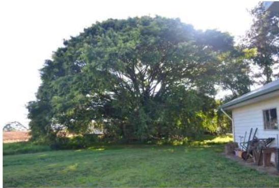
Plate 13. Spreading fig tree on northeast side of house, view east.