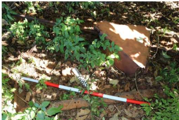
Plate 22. Rubbish dump including rail track and machinery