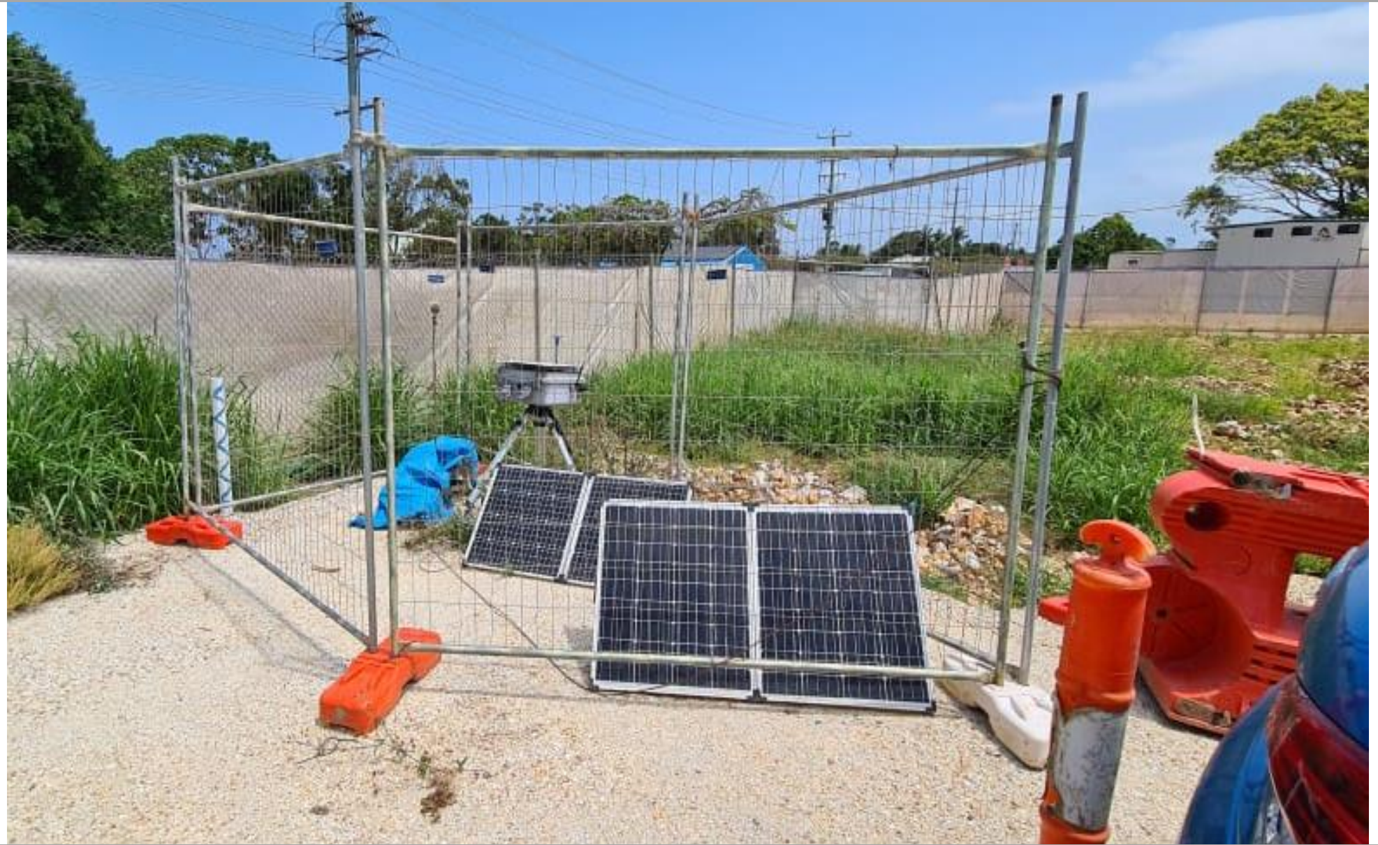
Photograph 1. Representative photo of monitoring location 001 – Adjacent Carpark location, as observed 24 November 2020