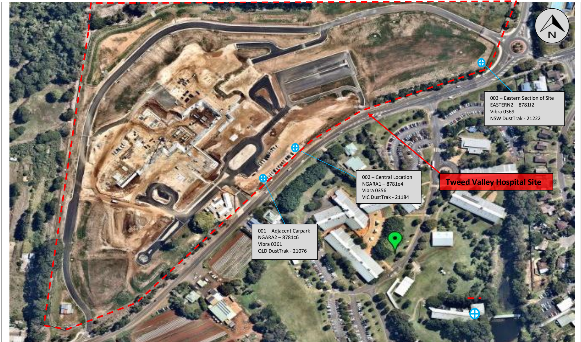
Aerial photograph of the Tweed Valley Hospital Project at Kingscliff, NSW (as of 30 October 2020).