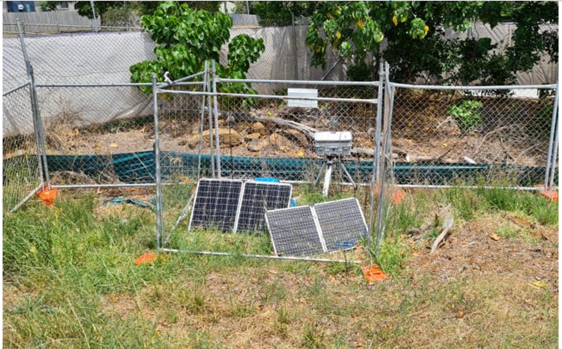
Photograph 3. Representative photo of monitoring location 003 – Eastern Section of Site, as observed 24 November 2020