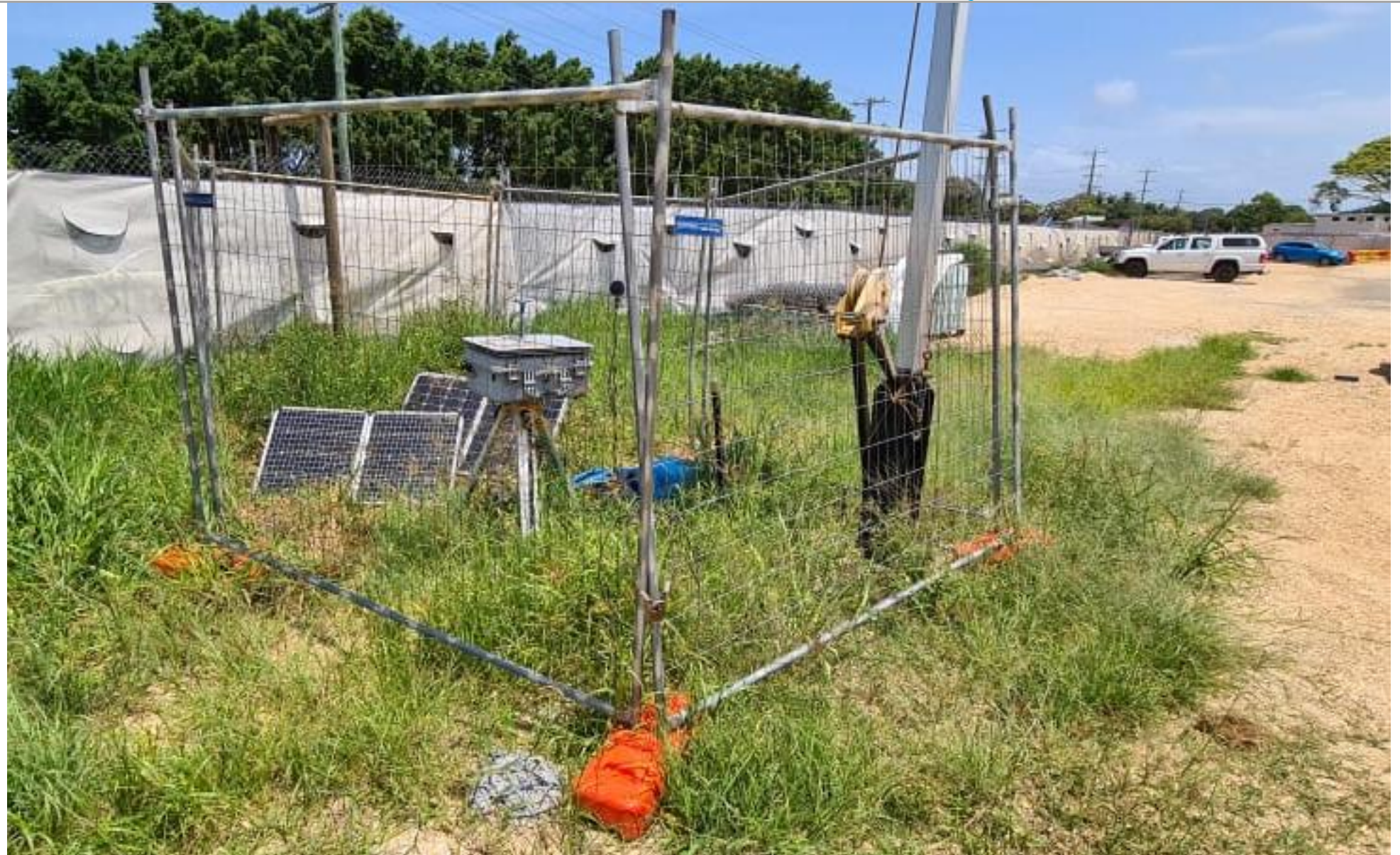
Photograph 2. Representative photo of monitoring location 002 – Central location, as observed 24 November 2020