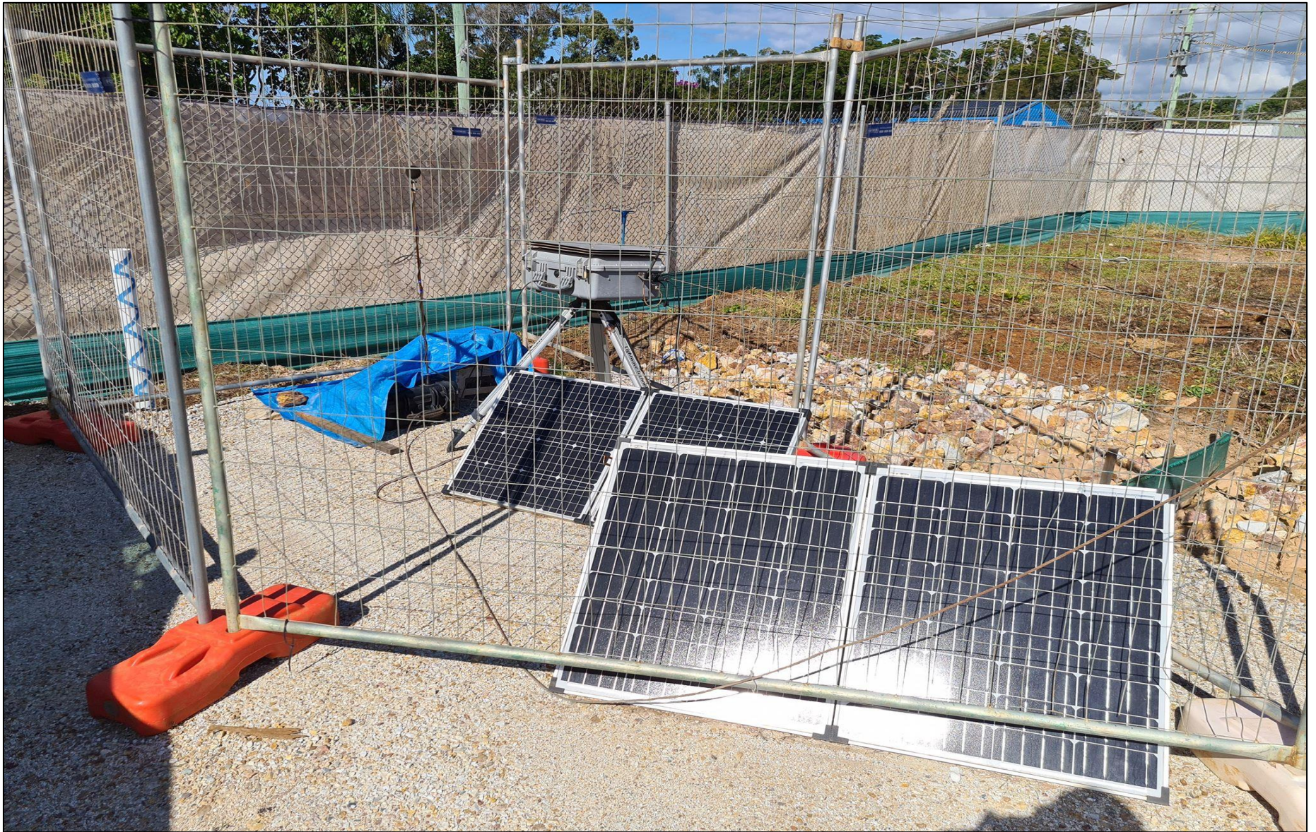
Photograph 1. Representative photo of monitoring location 001 – Adjacent Carpark location, as observed 04.08.2020.

Sydney Office: ADE Consulting Group Pty Ltd Unit 6 / 7 Millennium Court Silverwater, NSW 2128