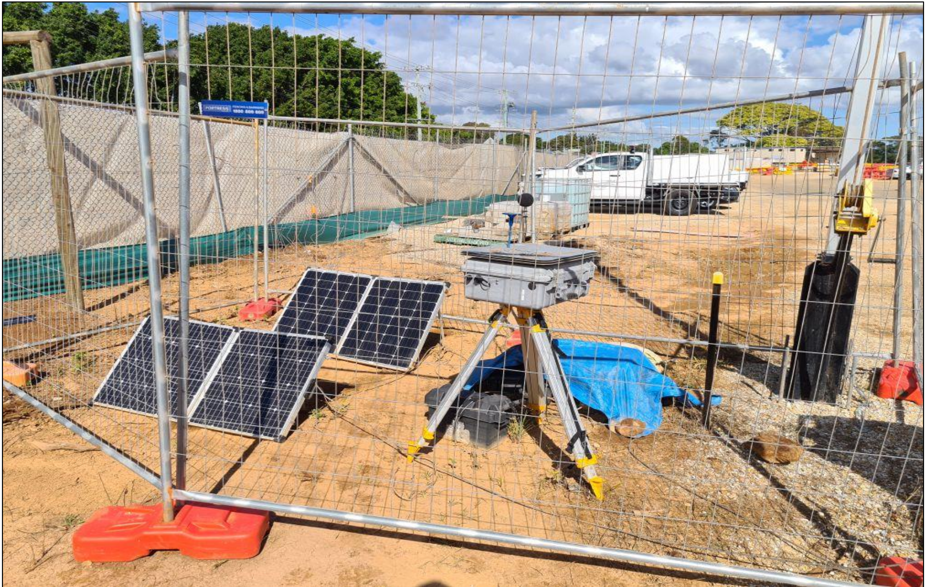
Photograph 2. Representative photo of monitoring location 002 – Central location, as observed 04.08.2020.

Sydney Office: ADE Consulting Group Pty Ltd Unit 6 / 7 Millennium Court Silverwater, NSW 2128