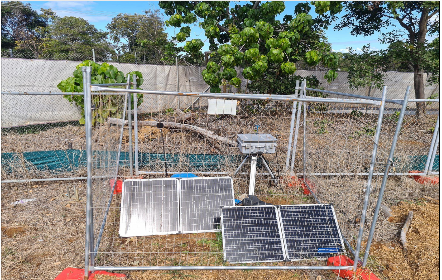
Photograph 3. Representative photo of monitoring location 003 – Eastern Section of Site, as observed 04.08.2020.

Sydney Office: ADE Consulting Group Pty Ltd Unit 6 / 7 Millennium Court Silverwater, NSW 2128