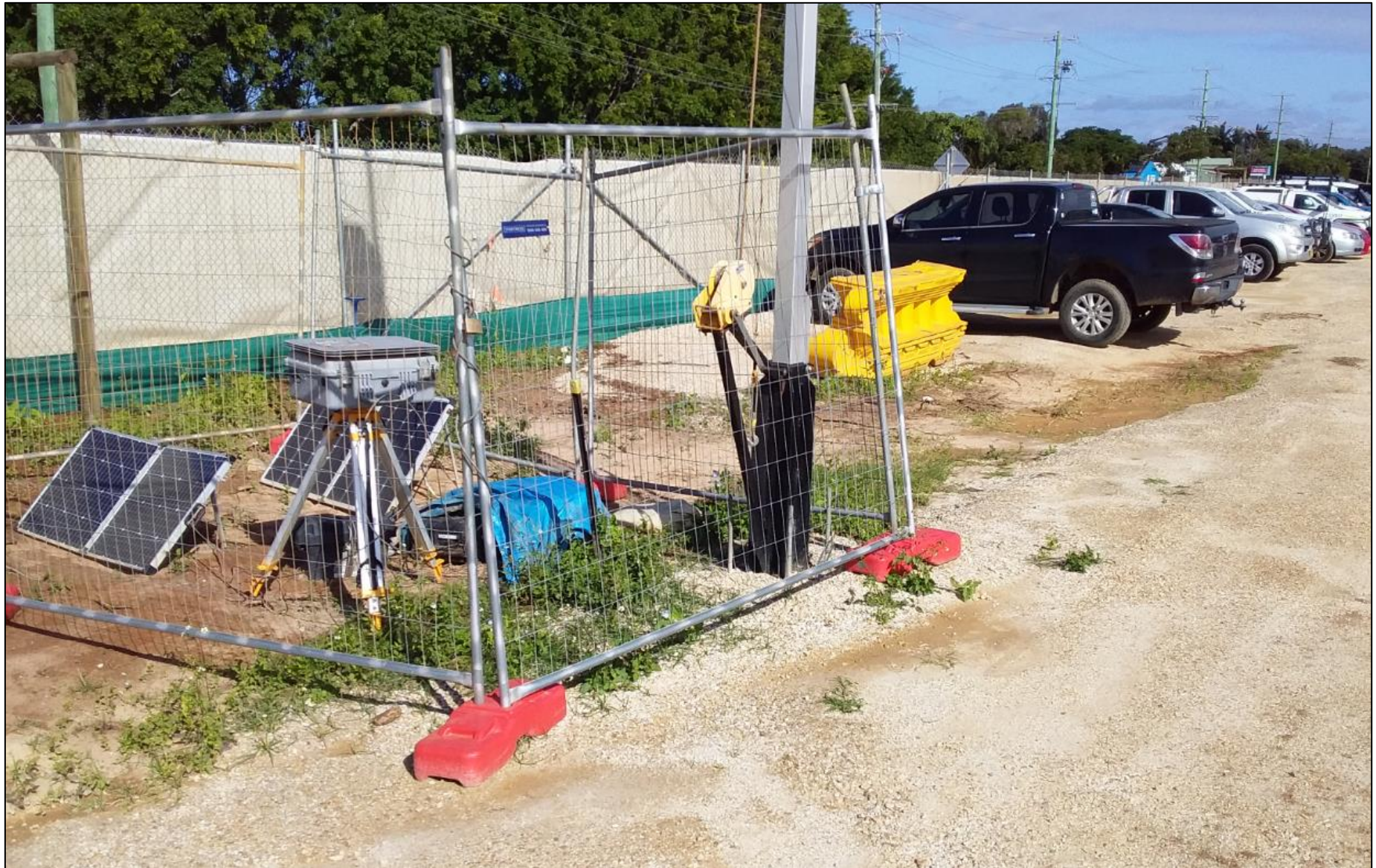
Photograph 2. Representative photo of monitoring location 002 – Central location, as observed on 18.06.2020.

Sydney Office: ADE Consulting Group Pty Ltd Unit 6 / 7 Millennium Court Silverwater, NSW 2128