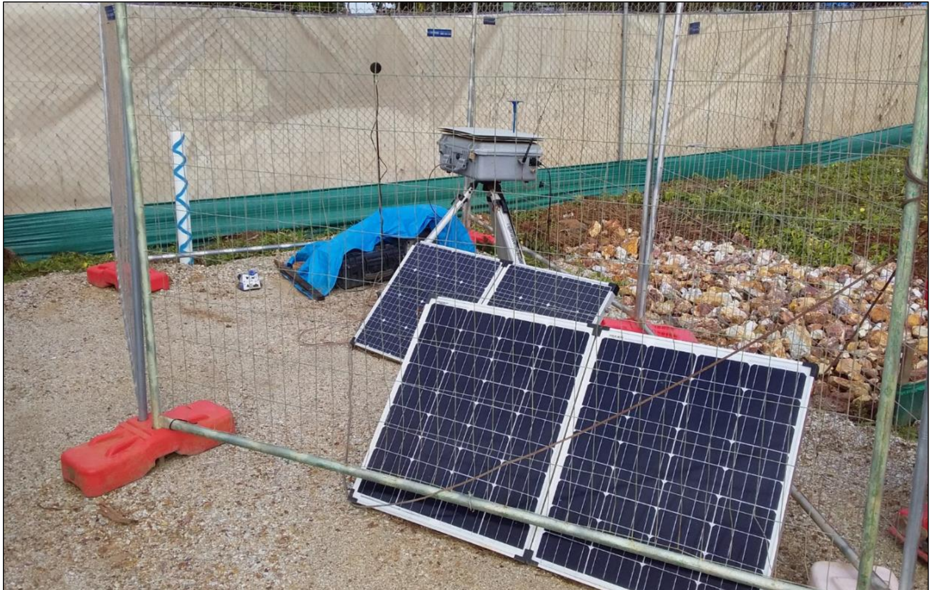
Photograph 1. Representative photo of monitoring location 001 – Adjacent Carpark location, as observed on 18.06.2020.

Sydney Office: ADE Consulting Group Pty Ltd Unit 6 / 7 Millennium Court Silverwater, NSW 2128