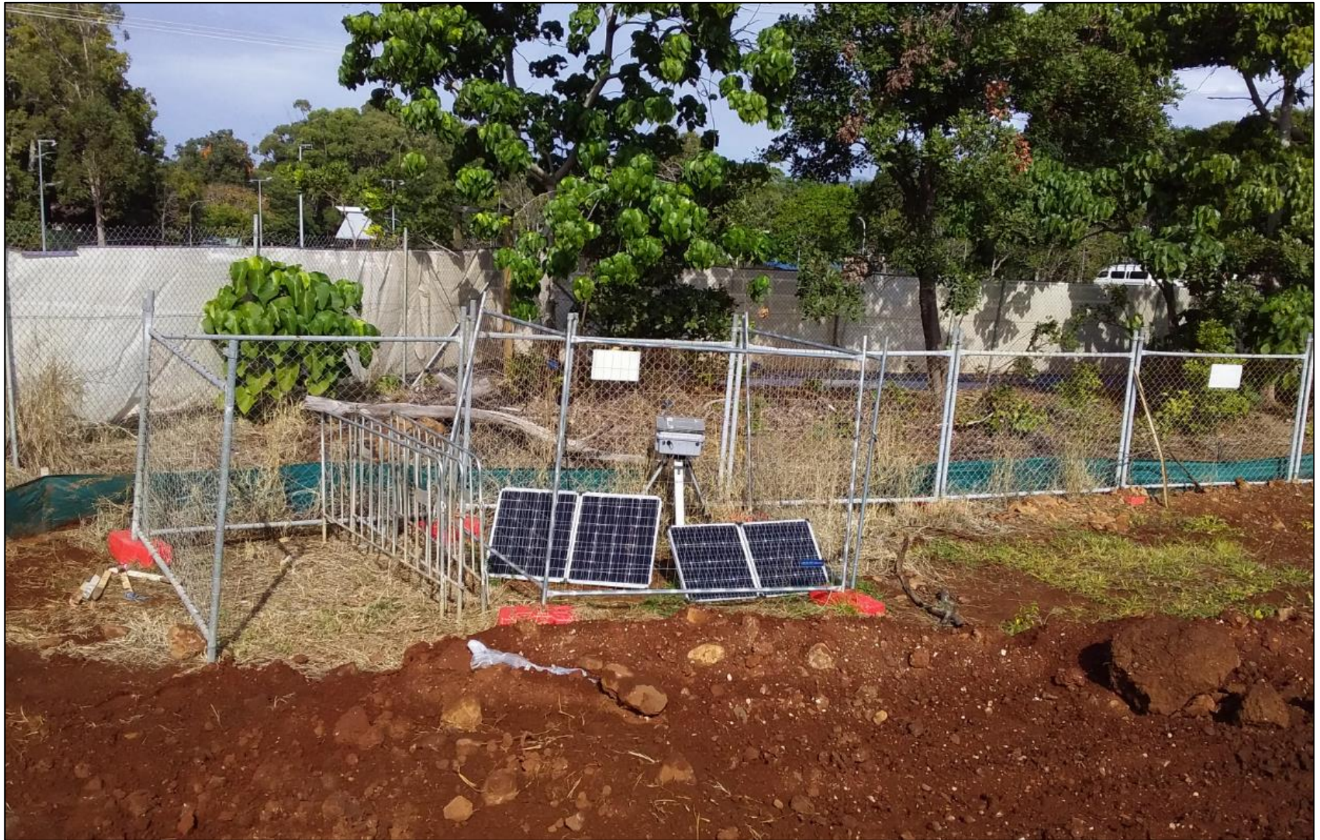
Photograph 3. Representative photo of monitoring location 003 – Eastern Section of Site, as observed on 18.06.2020.

Sydney Office: ADE Consulting Group Pty Ltd Unit 6 / 7 Millennium Court Silverwater, NSW 2128