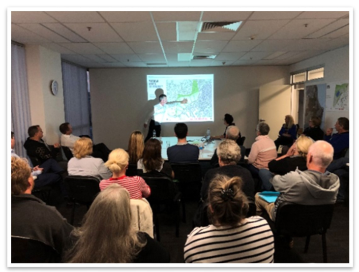
Masterplan presentation by the project architects

It also makes connections between buildings, social settings and the surrounding environment.