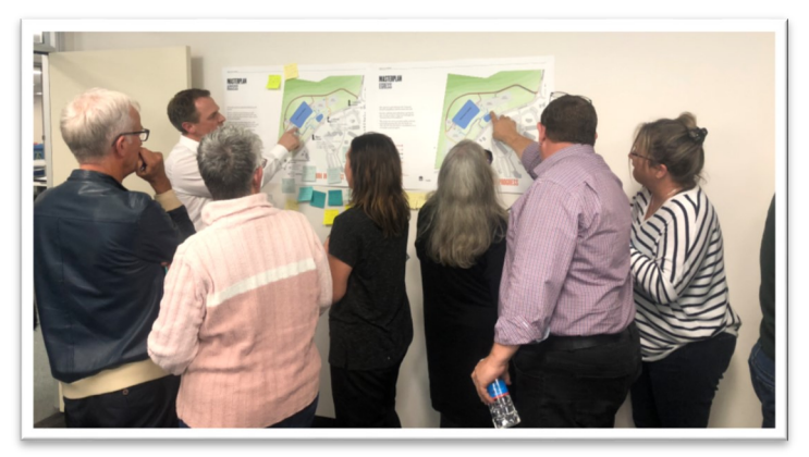
Panel members give their feedback on draft masterplan drawings

Groups were assigned 15 minutes for each topic. To facilitate genuine feedback and two-way discussion, members responded to the plans, set up as three stations across the room, by placing sticky notes on large printouts of the plans. A project team member was assigned as a facilitator for each station to provide information, respond to questions and guide discussion.